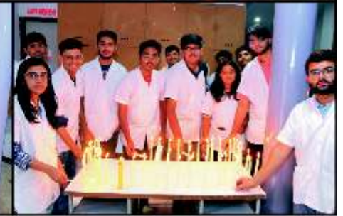
SCIENTIFIC PROGRAMME IN ASSOCIATION WITH HCG CANCER CENTER, A'BAD ON 26-03-2023