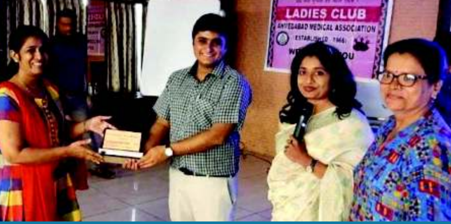
PRIDE OF AHMEDABAD MEDICAL ASSOCIATION - 12th 2019