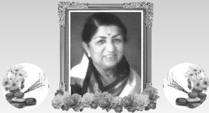
Lata Mangeshkar “Nightingale of India”

We send our sympathy & condolence to the bereaved family. May their soul rest in eternal peace.